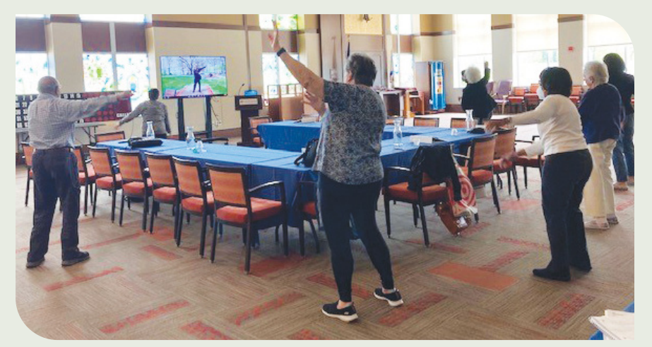
Lifestyle Care Program participants doing Tai Chi.

Mozaic Senior Life is excited to be hosting a Lifestyle Care Program for our staff, Residents, and members of the greater community. The weekly program runs from April through October and includes discussions, exercises, and diet guidance. This is an evidence-based program recognized by the CDC and facilitated by a certified Lifestyle Coach, Fitness Instructor, and Registered Dietitian. Overseen by a Medical Doctor, the program is designed to decrease the risk of heart disease, stroke, cancer, and complications of type 2 diabetes. There have been many positive outcomes from previous sessions of this nationally known program, including weight loss, lower A1C values, and reducing or eliminating the need for medications for high blood pressure. As the program progresses, our current participants are looking forward to gaining insight from the information provided, adopting new health and lifestyle behaviors, and tracking their individual progress. Stay tuned for our current participants' success stories!