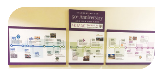
50th Anniversary timeline hanging in the front hallway.